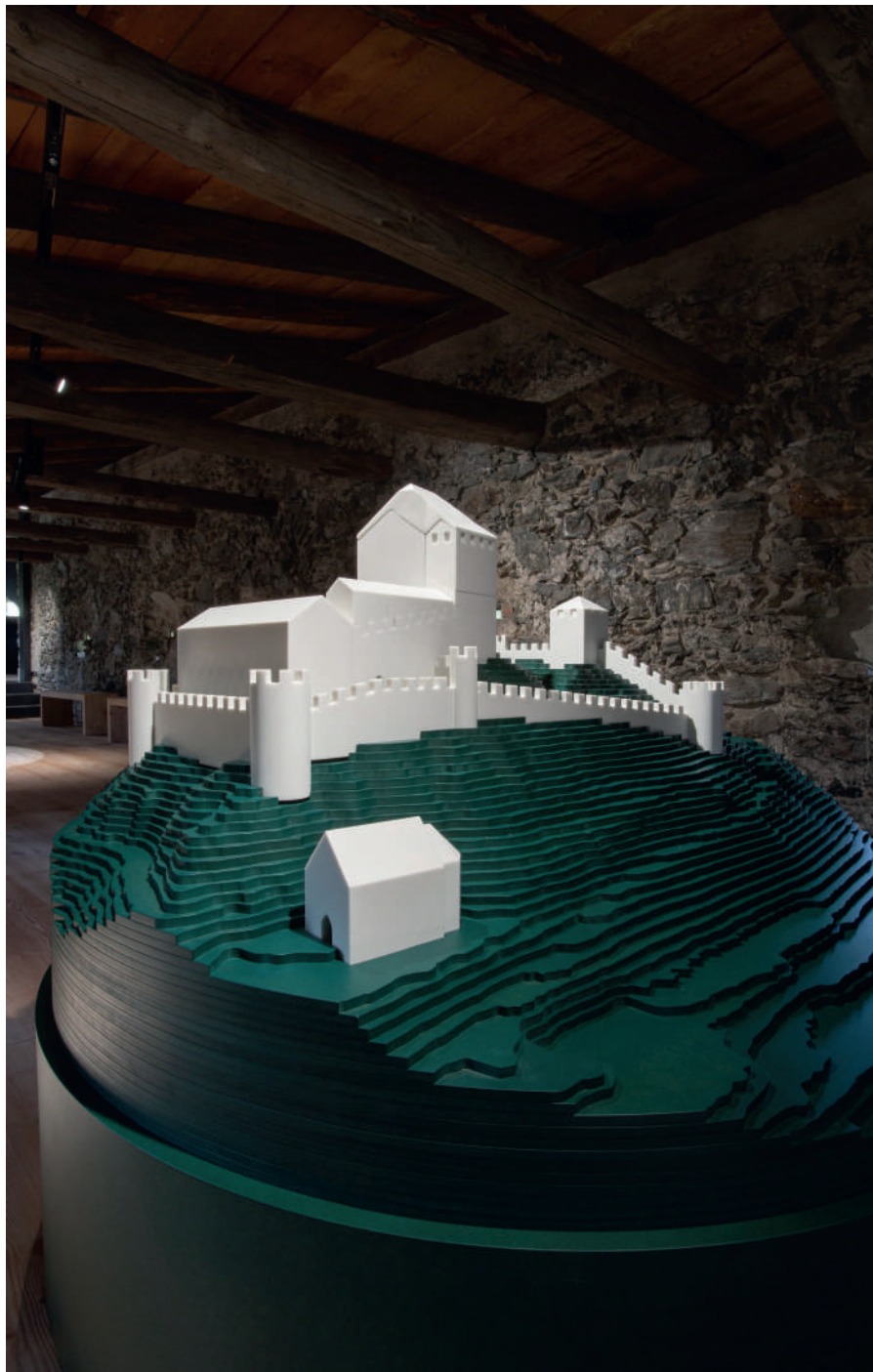
MUSEUM BURG HEINFELS East Tirol

A castle made of solid surface material – what was once not possible yet, can now be seen at the Museum Burg Heinfels. The use of this material runs as a white thread throughout the permanent exhibition and culminates in a detailed miniature version of the castle measuring just 94cm long and 59cm wide. With fine milling heads, the